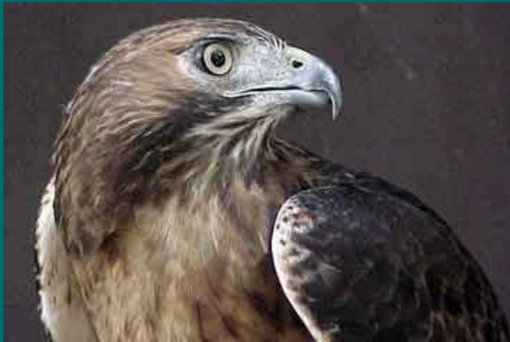
Beauty is our Red-Tailed Hawk