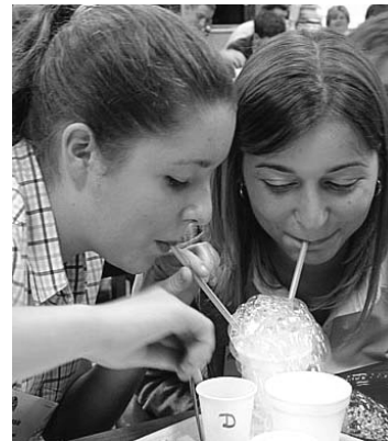
Science Fun with Dairy Foods