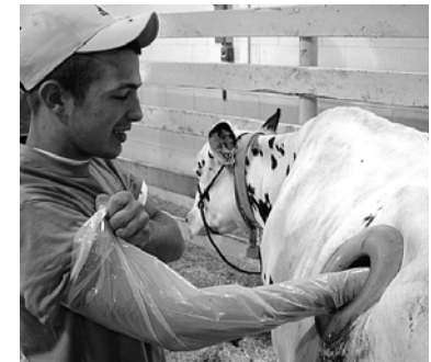
Roaming thru the Rumen