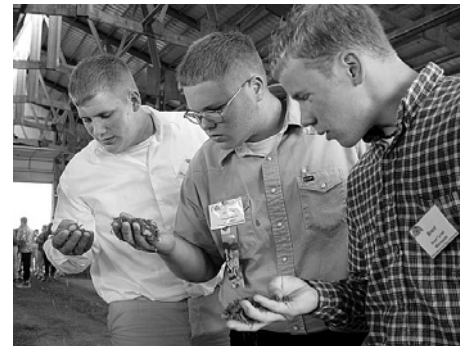
Educational Off-site Experiences