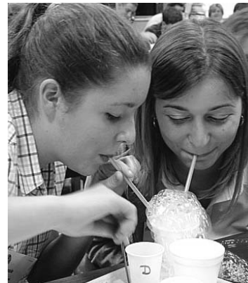
Science Fun with Dairy Foods