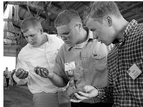
Educational Off-site Experiences